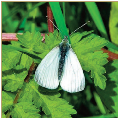
Green-veined White Butterfly