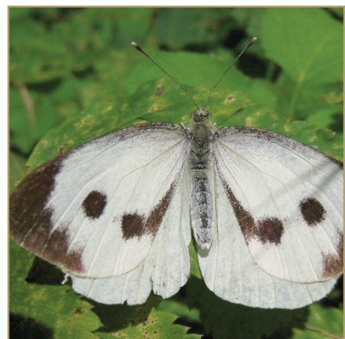
Large White Butterfly