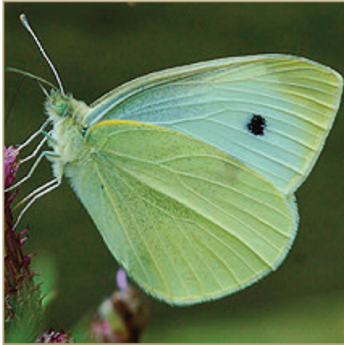
Small White butterfly

There are many butterflies and moths to be found in the grounds of Leeds Castle in the summer, especially in the Culpeper Garden. See how many you spot today.