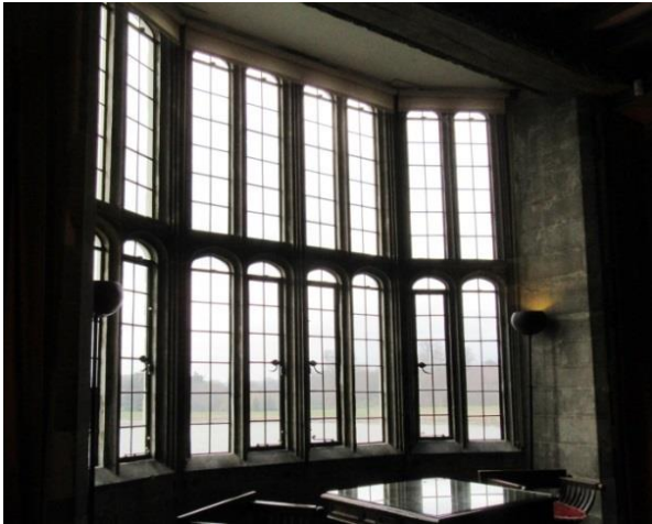
The bay window was installed by King Henry VIII