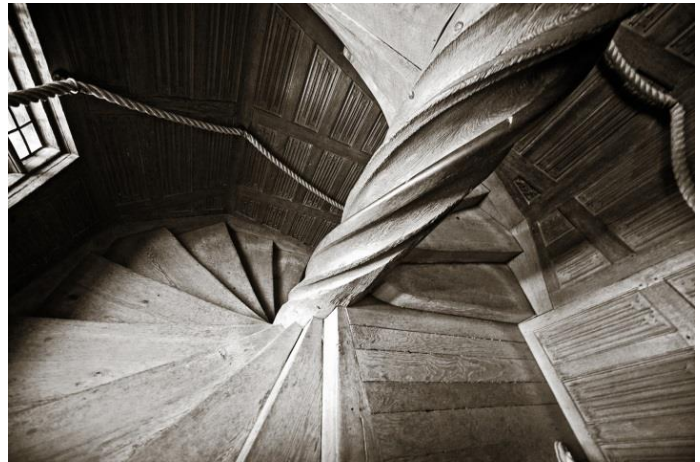
Spiral staircases are often found in castles How many steps can you count?