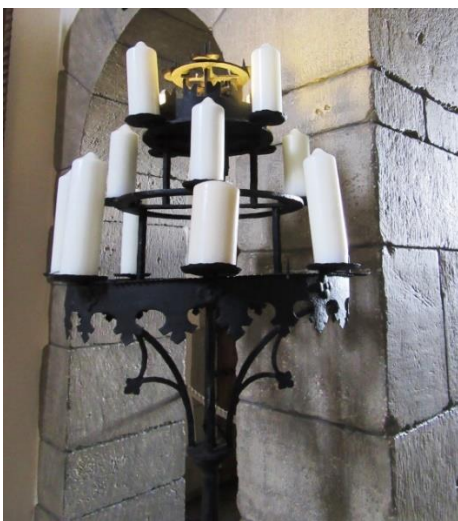
Candles provided the lighting in a castle