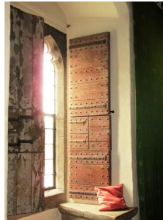
Castles were very cold. The shutters kept out draughts