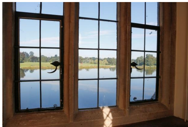
Look out the window to see the moat beneath. The moat was a great defence against attack