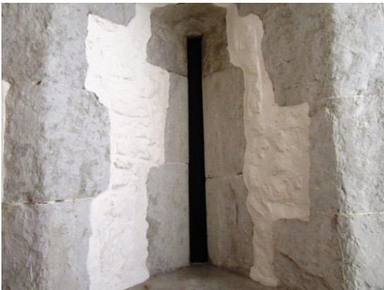
Arrow slits in walls allowed arrows to be fired out. They are also called Loopholes..