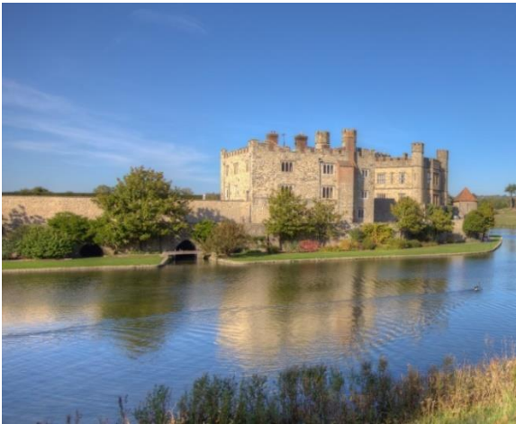
The arches in the lower wall lead to the Medieval Bath House created for King Edward 1