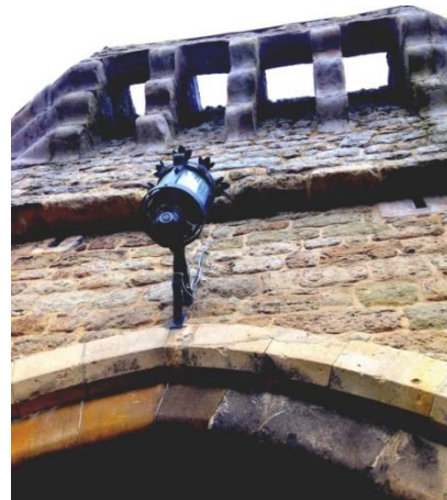
Machicolations (Murder Holes)