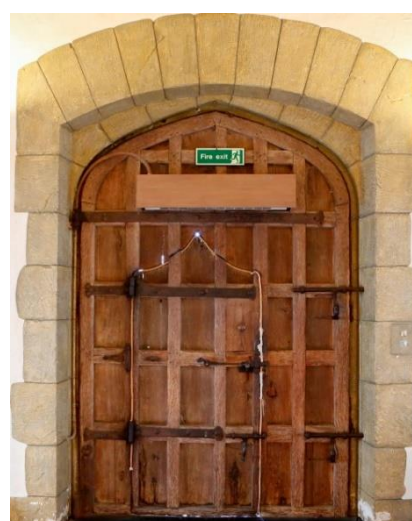
A door within a door